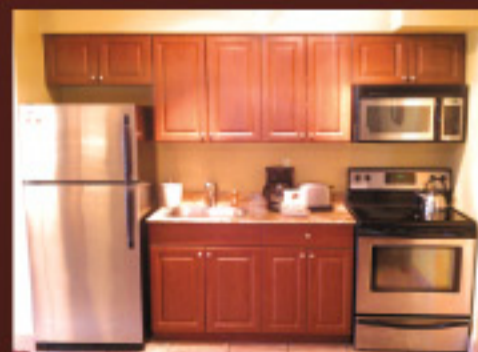
FULL SIZE STAINLESS STEEL APPLIANCES