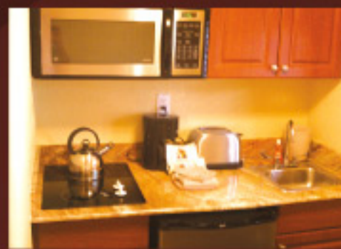
COMPACT KITCHEN STAINLESS STEEL APPLIANCES W/ MINI FRIDGE