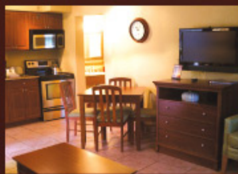
32" FLAT SCREEN CABLE TELEVISION