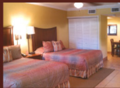
TWO DOUBLE BEDS

Efficiencies feature fully equipped Compact Kitchens with Stainless Steel Appliances.