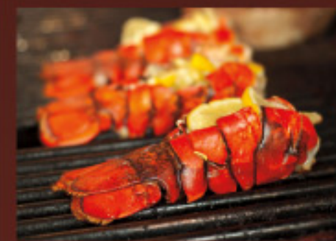
FULL SIZE GRILL BY THE POOL