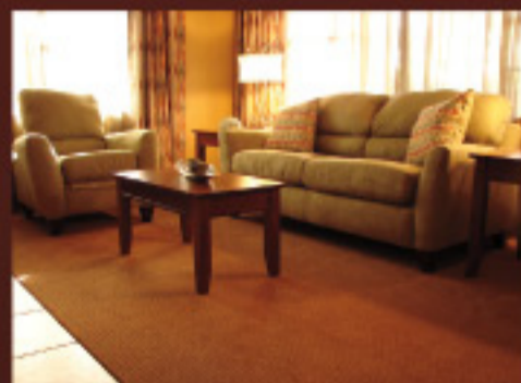
HIGH QUALITY QUEEN SLEEPER SOFA